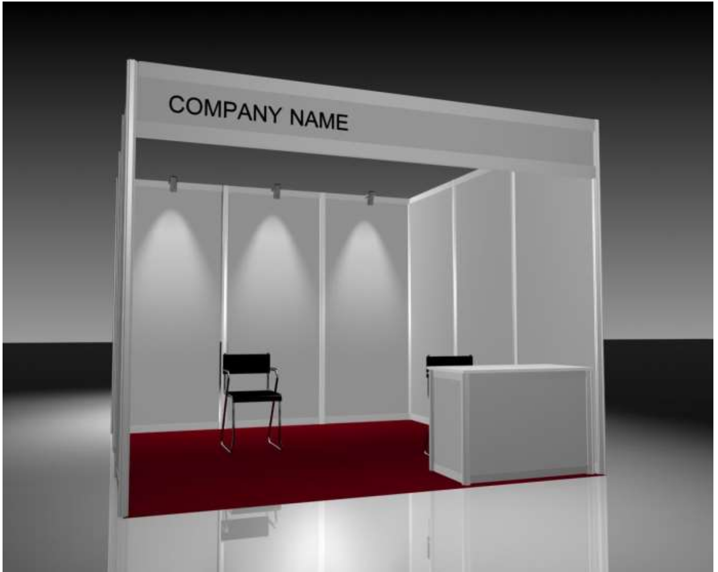
*Indicative pic only, furniture package as mentioned below